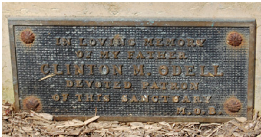
Dedication on the patio benches for Clinton Odell

Shelter in the Woodland Garden near the location of the former Garden Office (dedication tablet - small photo). These were presented by his daughter, Moana Odell Beim; installed in 1960. They replaced a pair of wooden "settees" that at the time, were very close to the site of the old "office."