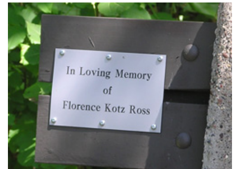
Bench dedication to Florence K. Ross, situated on the far hill at the back of the Upland Garden.