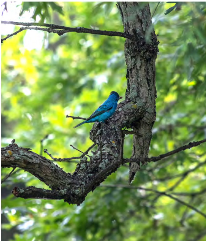
An indigo bunting takes a brief pause in the prairie on a clear July day.

Due to ongoing COVID-19 restrictions on larger gatherings, we will be having our Annual Member Meeting this fall via Zoom video conferencing. If you can join us, please download and make sure your Zoom application is up-to-date. Meeting ID: 406 195 8513 Passcode: 991400