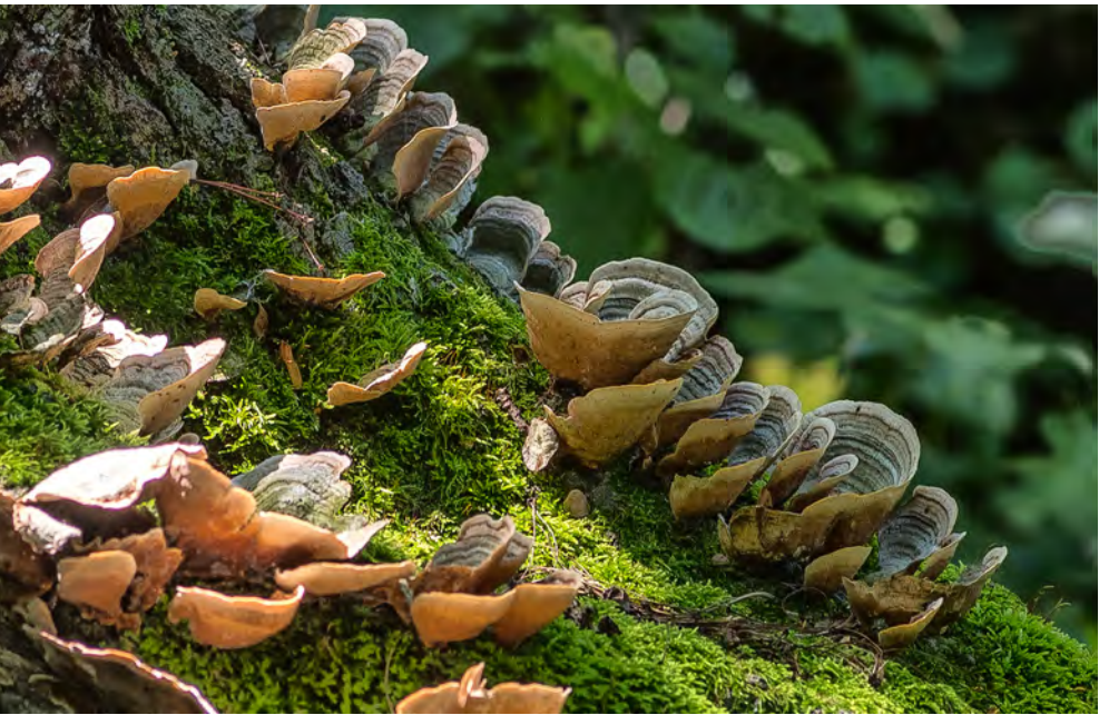
Turkey tail mushrooms are a common sight on fallen logs around the Garden

This article appears courtesy of the Minneapolis Park & Recreation Board