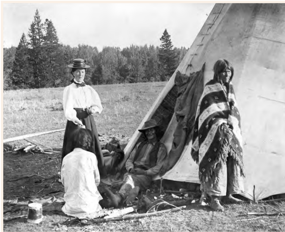
Frances Densmore, ca.1900 at a Chippewa encampment.

Densmore's material has been included in many of the specific plant information sheets on the Friends website.❖