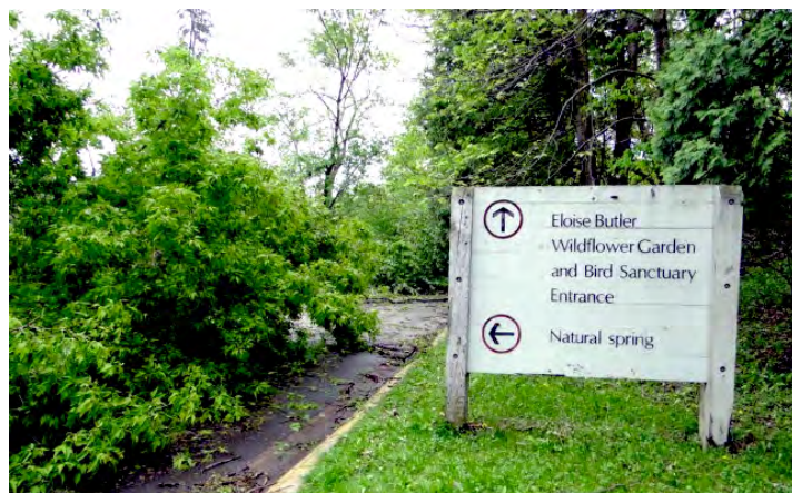
Trees down on the Garden entrance road from the tornado of May 22, 2011.