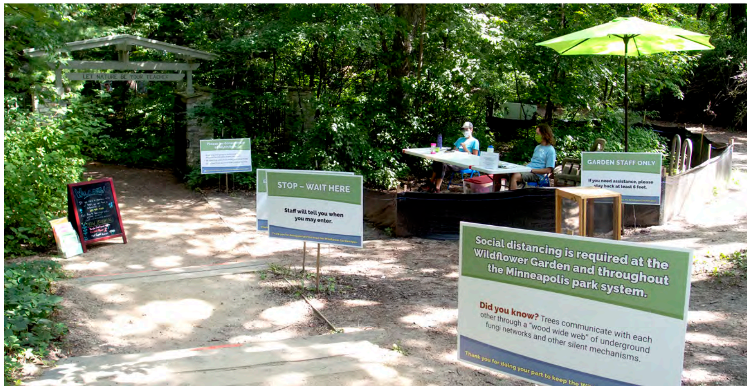
Garden staff await visitors at the front gate. When the Garden opened in June, signs and staff inform visitors of new procedures to follow when entering and experiencing the Garden.