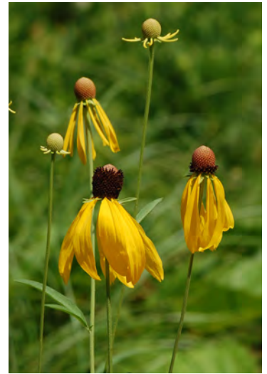
Blooms of mid-summer: Culver's Root (left). Gray-Headed Coneflower (right).