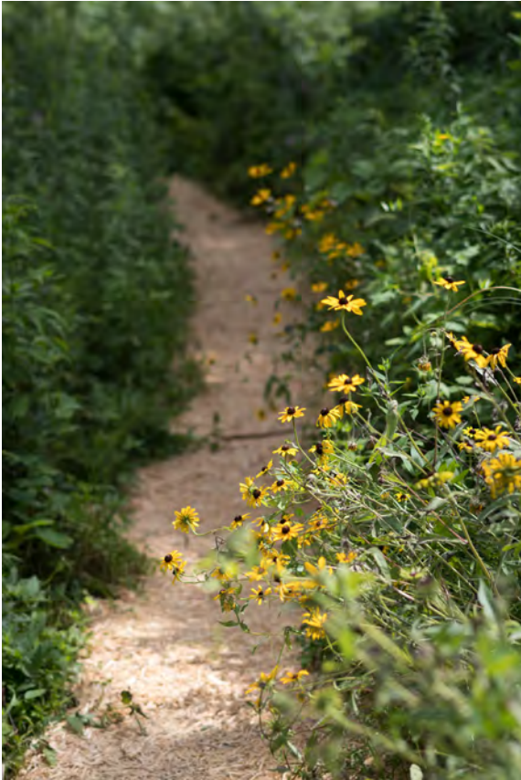
Black-eyed Susans grace the prairie's summer trails.

You can also stay connected to the Garden by visiting the Garden on