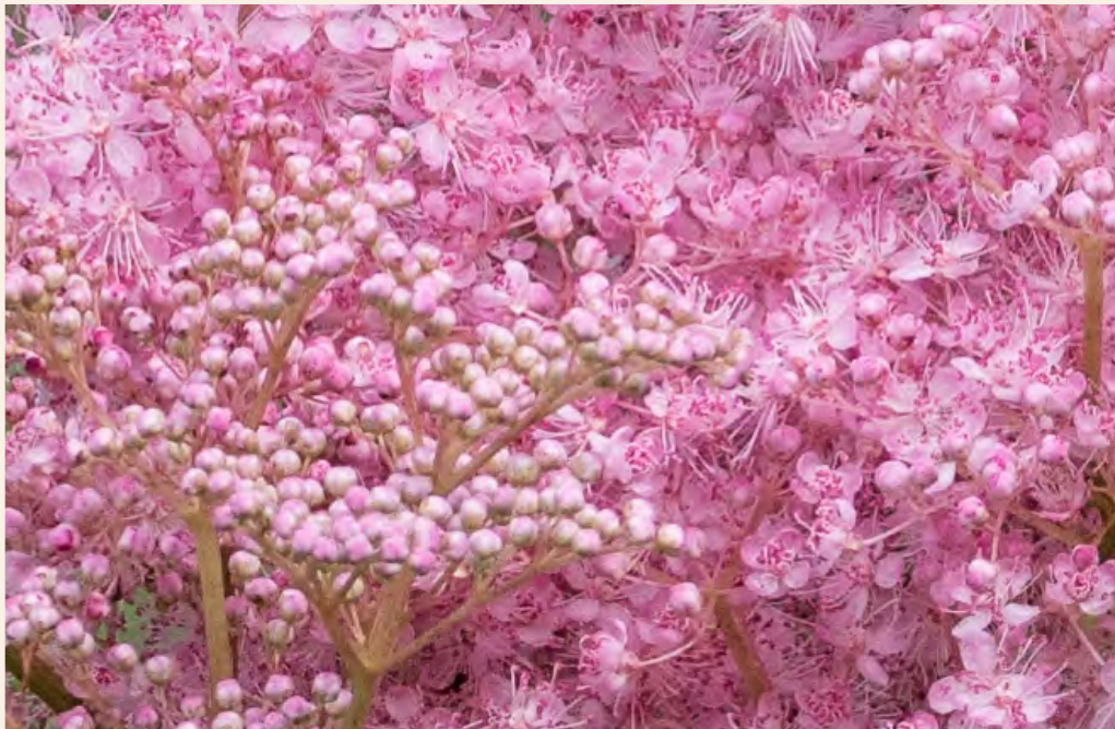
A sea of brilliant pink, Queen of the Prairie is one of the summer wetland's brightest stars.

the United States, established in 1907. The 15 acre site is located within the city of Minneapolis on Dakota homelands and is owned and operated by the Minneapolis Park & Recreation Board. The Garden is open from April 1 through October 15 from 7:30 A.M. to one hour before sunset. Weekends only October 15 to October 31.