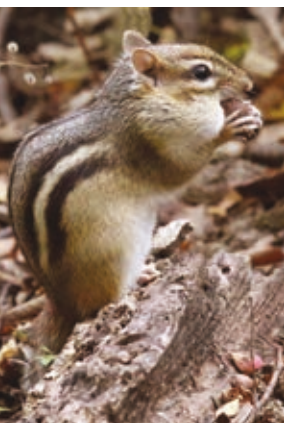
ALVIN THE (EASTERN) CHIPMUNK stores his acorns in an underground den, which he continues to dig for his entire life.