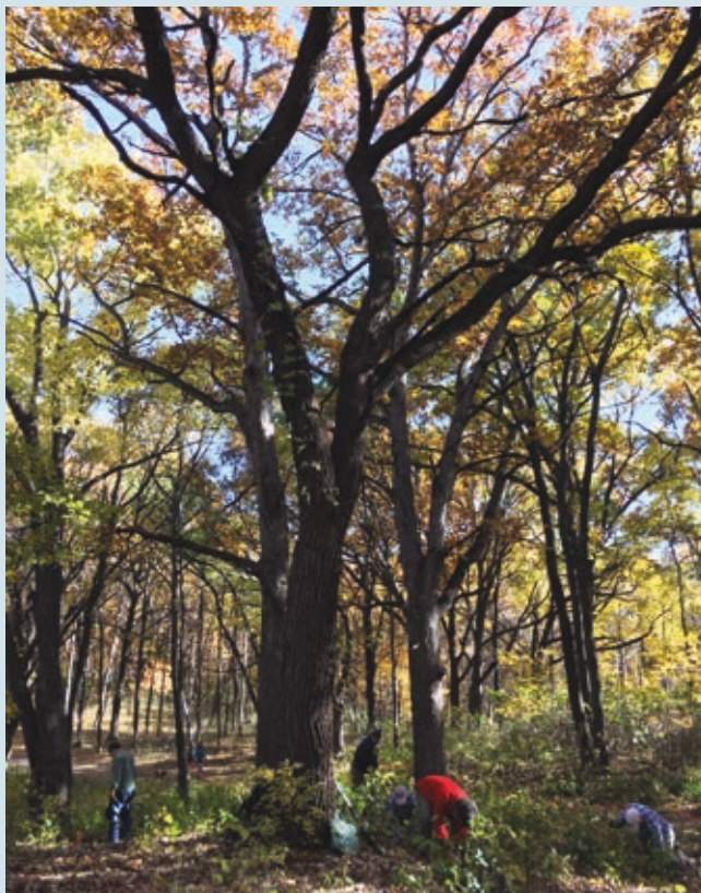
FIPAG volunteers weed-wrench and pull up invasive buckthorn in an area of the Maple Glen where older cut stumps have re-sprouted.

As we head uphill, we approach a scene dominated by buckthorn stumps re-sprouted from a previous cutting. Those are the worst! Even so, I can see the results of the thinning we’ve done in past years. For our next buckthorn pull we decide to continue selectively thinning the