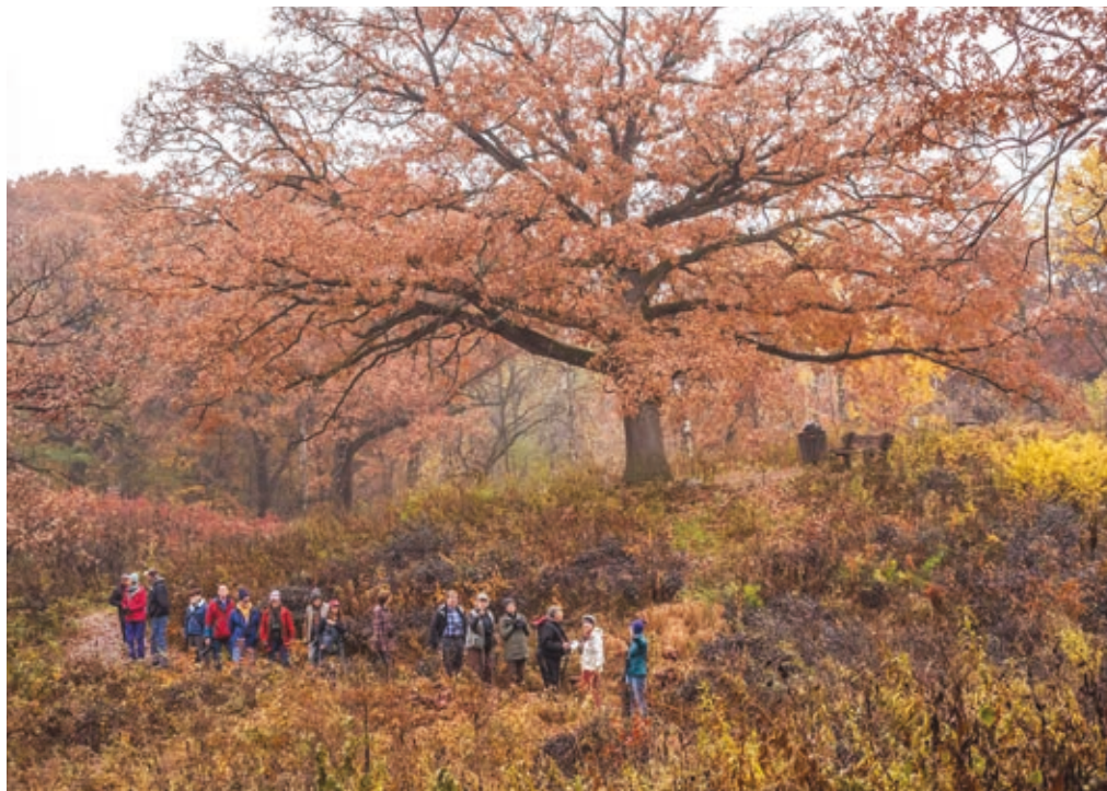
A FLOCK OF BIRDERS collect along a trail in the Upland Garden in late October.

It has been rewarding to watch our programs grow and reach new audiences. This season two tremendously successful toddler/