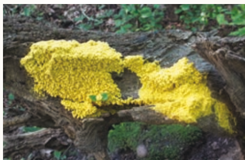
(top) YELLOW-FUZZ CONE SLIME MOLD, Hemitrichia clavata (mature, left, and immature, right) (above) DOG VOMIT SLIME MOLD, Fuligo septica (plasmodial phase)

slime mold. You might encounter the plasmodial stage as a blob of yellow living slime networked with veins. The blob moves too slowly to observe its motion—a millimeter or so per hour. You can find plasmodia in cool, shady, moist habitats such as rotting logs, stumps or leaf litter.