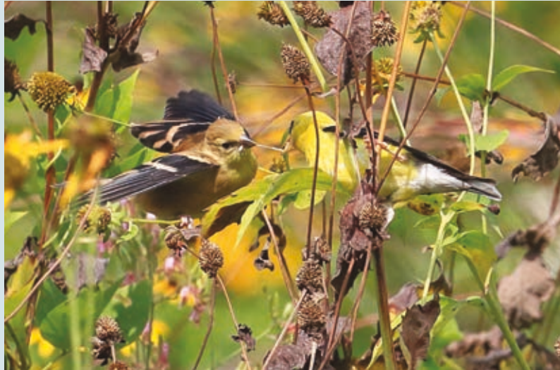
GLINTS OF SUMMER'S END surround a juvenile and adult goldfinch feeding in a stand of coneflower in the Upland Garden.