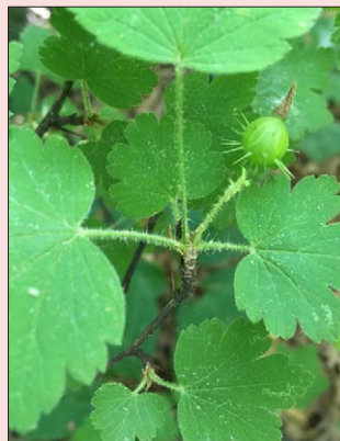
EASTERN PRICKLY GOOSEBERRY