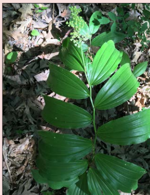
FALSE SOLOMON'S SEAL