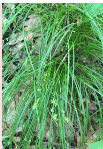
SEDGE in the Maple Glen