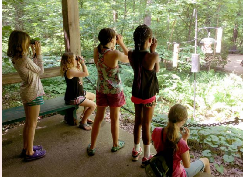
FOURTH GRADERS WATCH FOR BIRDS at the Shelter’s feeding station, part of a summer program of the Minneapolis Public Schools that brought 552 students to the Garden in June and July.

A royal wedding and Butchart Gardens have their allure and are fine to see once in a while. A homey wedding and a wildflower garden are appealing in a more relatable way. Visitors sometimes come to the Garden and are disappointed because their expectation is more Butchart than Butler. I wish I could greet these people and bring them to the quiet corners of the Garden where the wild plums stand, and to the bright oak knoll where the indigo buntings perch. I would take them to the overlook where wild rose and false blue indigo paint the