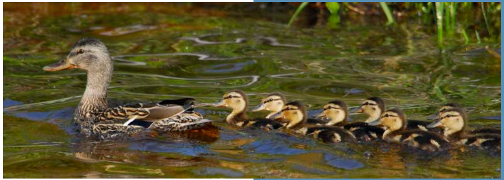
DUCKLINGS are some of the first baby birds seen in the breeding season.

Walking through the Garden and South Wirth Park in summer, watch for adult birds carrying food and listen for the soft peeping of nestlings and the not-so-soft begging of older chicks. Look for the clumsy antics of the fledglings and listen for the alarm calls of the parents when, as curious birders, we get too close. 🌸