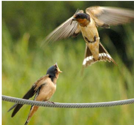
BARN SWALLOW PARENTS find their chicks wherever they land.