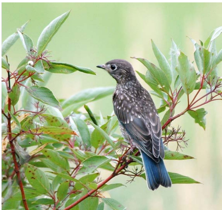
SPOTS OR STREAKS AND DULL COLORING will help hide fledglings like this eastern bluebird from predators.

On the other hand, songbirds, like chickadees, robins, finches and blue jays, have altricial young. Their chicks hatch with few if any feathers and with their eyes closed. They are very weak and can barely hold up their heads. They are completely dependent on their parents and will remain in the nest for about two to three weeks. For the first few days, one of the parents must keep the nestlings warm. The other parent must provide a constant supply of protein-rich food for the family. As the chicks’ feathers fill out, both parents can leave the nest and forage for increasing supplies of insects to feed their young, especially fat caterpillars, spiders and other invertebrates. As an example, a robin might make 100 feeding visits to its nest each day. 1