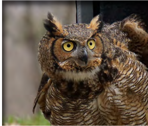
Far left: Owlet on the ground.