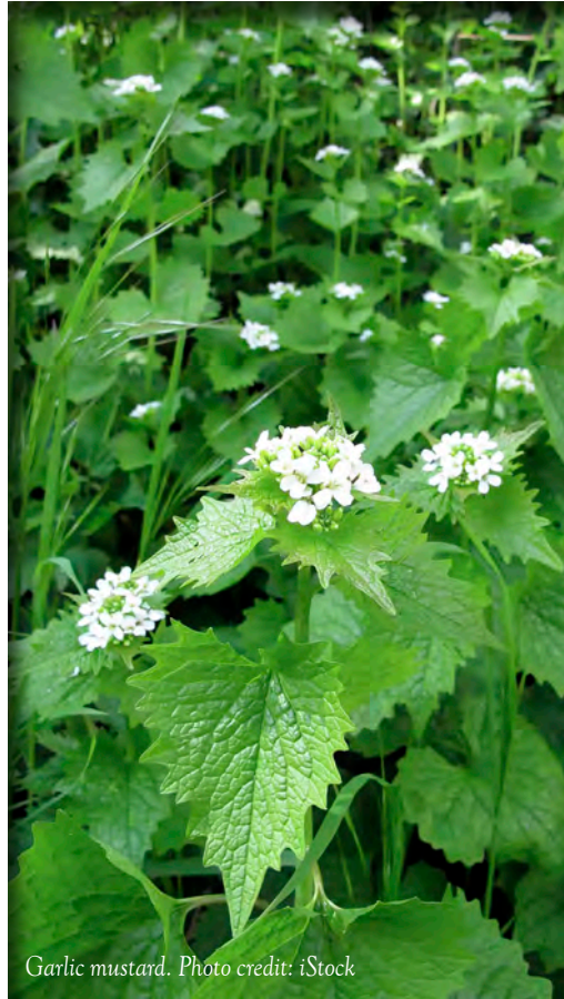
Garlic mustard.

Passersby who see us working will sometimes comment that the job seems impossible, but it's not. Our