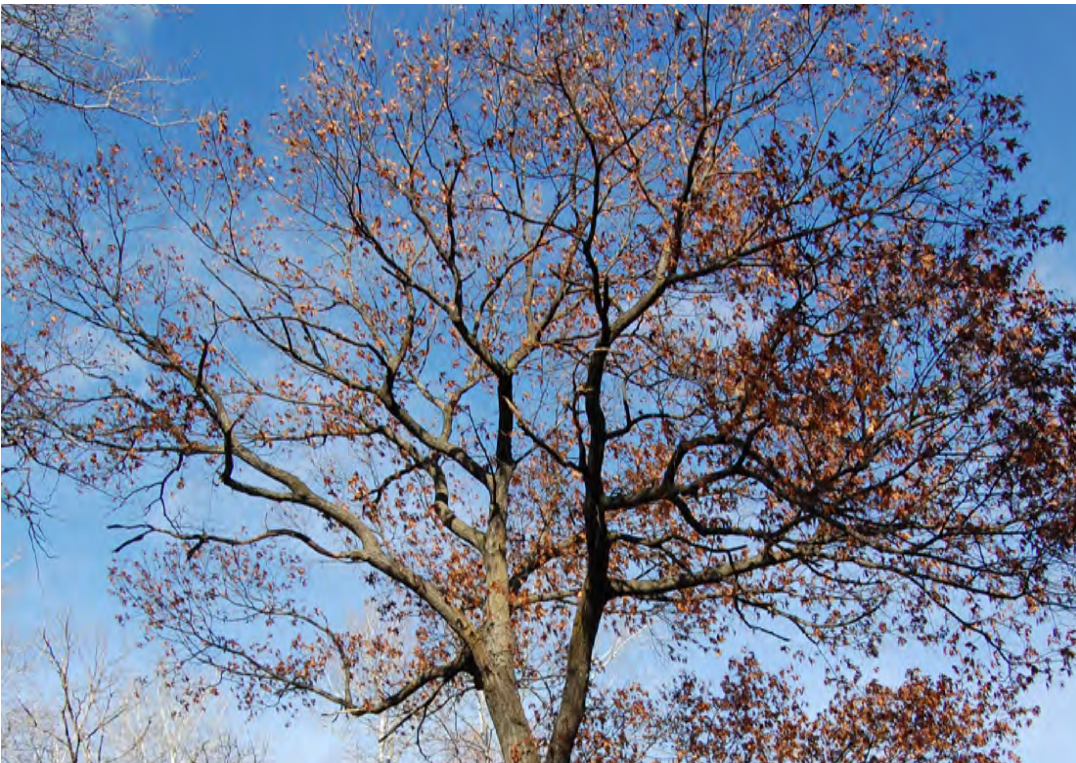
Below: The upland garden in the fall. Right: Larch and maple show their fall colors in the garden.

For Elsie Morton Barish from Dick & Sue Snell