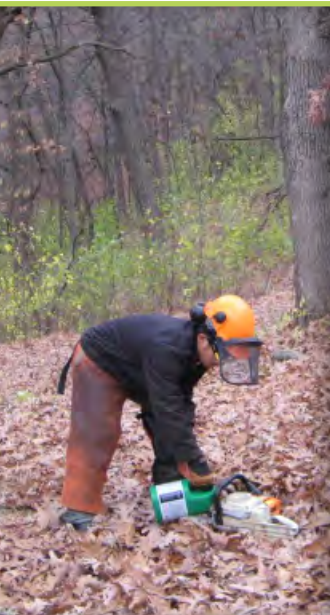
The Conservation Corps of Minnesota helps remove buckthorn from the Garden.