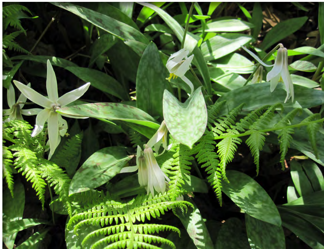
White trout lily

is comprised of cultivated but naturalistic woodland, wetland and prairie environments, 2/3 mile of mulch-covered pathways and a rustic shelter where educational programming and materials can be found. It is the oldest public wildflower garden in the United States. The 15-acre site is located within the city of Minneapolis and is owned and operated by the Minneapolis Park and Recreation Board. The Garden is open from April 1 through October 15 from 7:30 A.M. to a half hour before sunset.