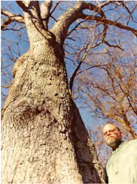
Above: Cary with the Heritage White Oak.

The tree canopy of the Garden performs many functions and changes in the makeup of the canopy causes changes in the understory plants. Ken Avery had to deal with the loss of elms in the Garden from Dutch Elm disease. Cary George dealt with the loss of oaks to Oak Wilt. The red oaks in the Garden were particularly large; Cary estimated the age of several that succumbed in 1994 to be 125 years old. The most visible loss to frequent Garden visitors were those that stood apart from the mass grouping of trees - those specimens that form the edges around the Upland Garden. Replanting of trees in the Garden has been a continuous process since Eloise Butler's tenure and continues to-date. Butternuts were not found in the Garden originally so Eloise Butler began planting them in 1909. They are not a long-lived tree but are a native species. One that Cary estimated to about 100 years old blew down in a storm in June 2003. Was it one that Eloise planted?