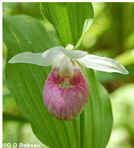
Showy Lady's-slipper ( Cypripedium reginae )

"The wildflower most often asked about by Garden visitors is the Showy Lady's-slipper (Cypripedium reginae). Each spring dozens of inquiries are made about the existence of this wild orchid in the Garden, its cultural requirements, sources of purchase and the legal and ethical ramifications of digging and transporting it. By the time it blooms at the end of May, I must confess, I'm relieved. Yet, when I walk the bog trail each morning to open the back gate, I stop to look at this wild orchid as the morning sun filters through the dewy bog air. Its beauty always amazes me. It must be one of the most magnificent flowers God ever created." (Ref 3.)